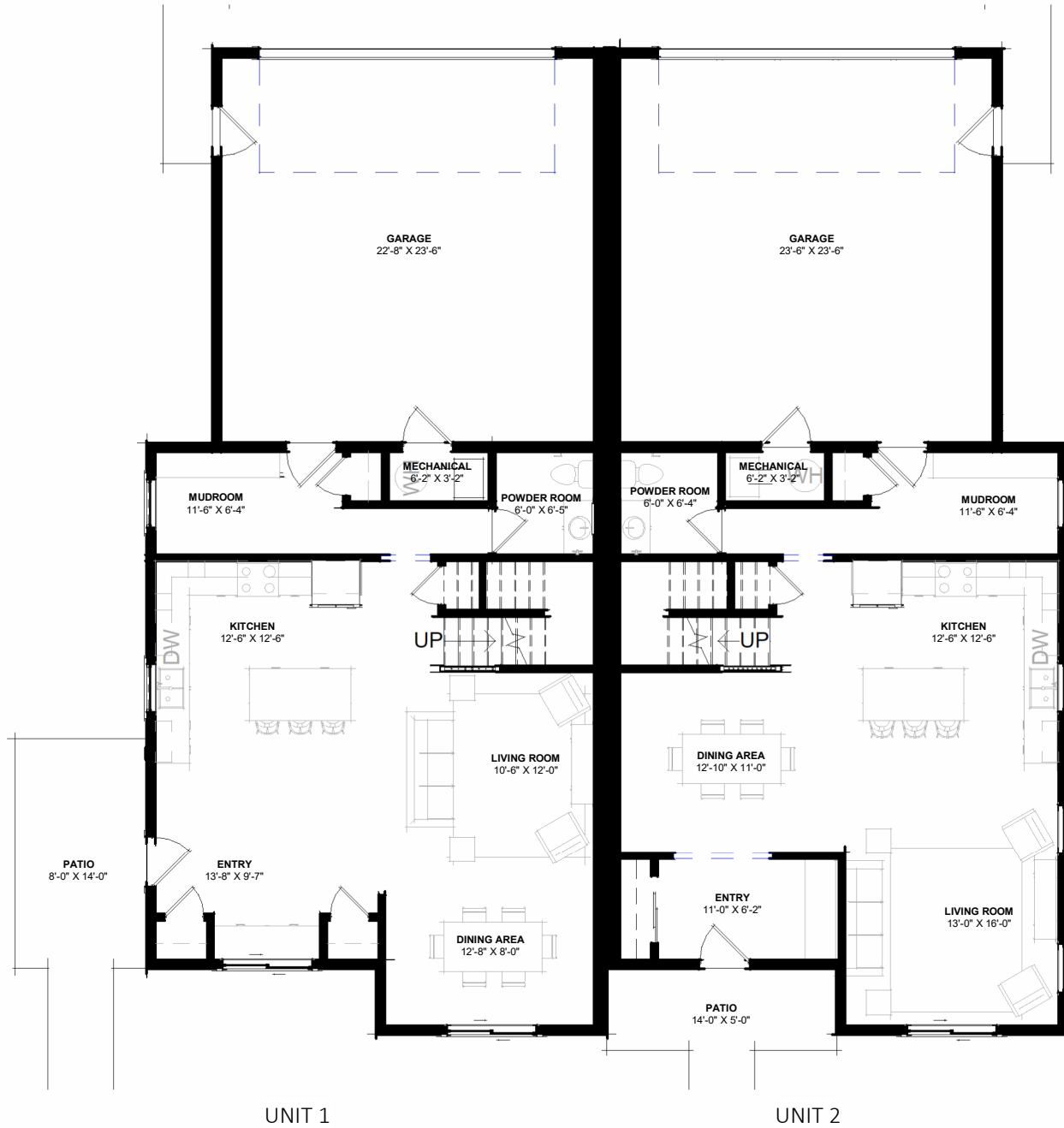
LEVEL 1 FLOOR PLAN